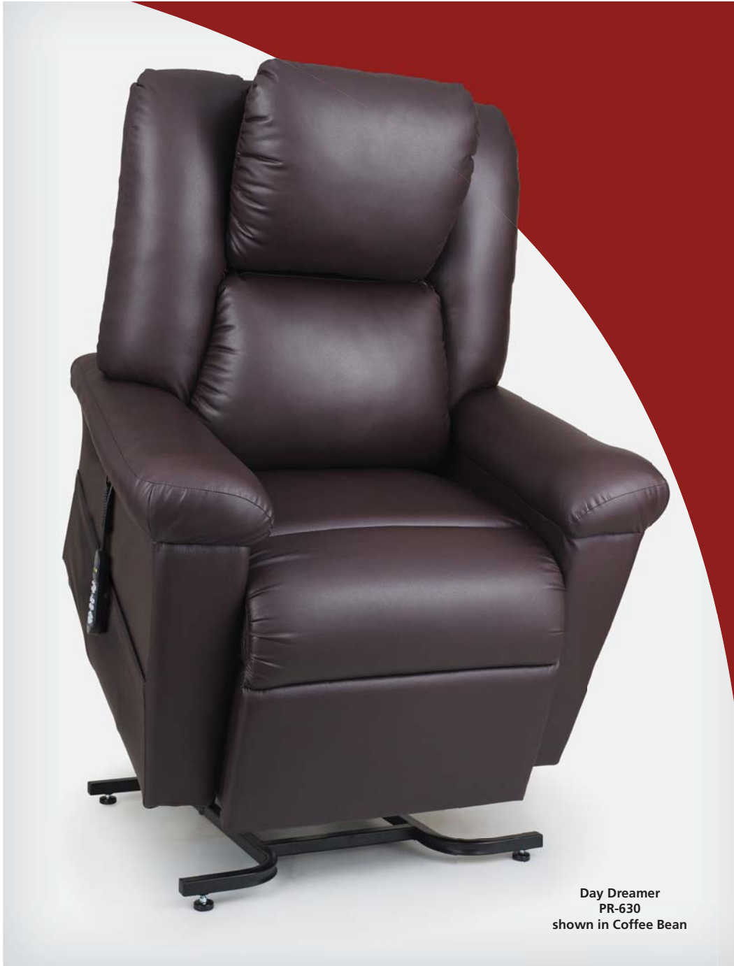
Day Dreamer PR-630 shown in Coffee Bean