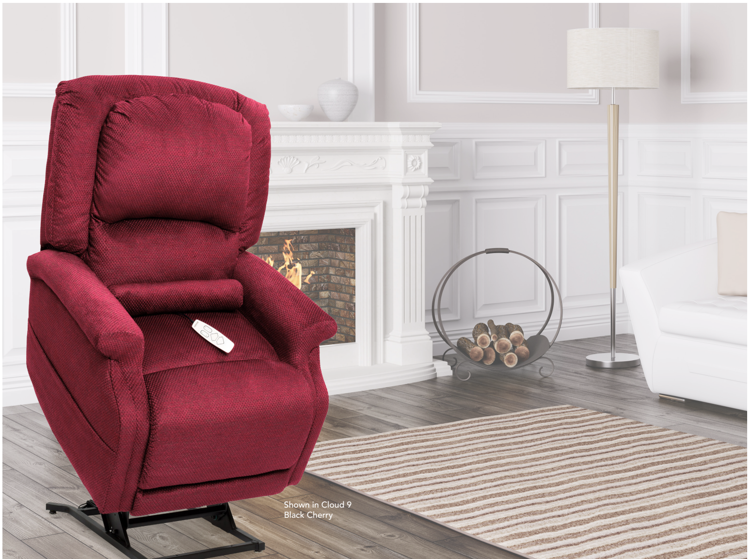
Shown in Cloud 9 Black Cherry